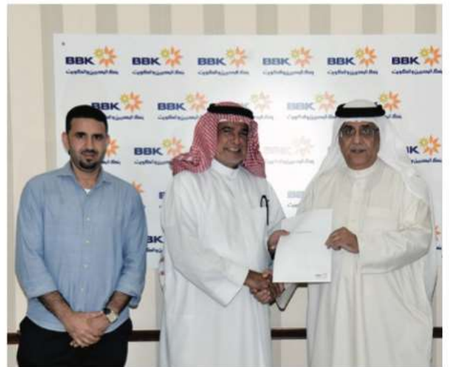
Muharraq Social Welfare Centre