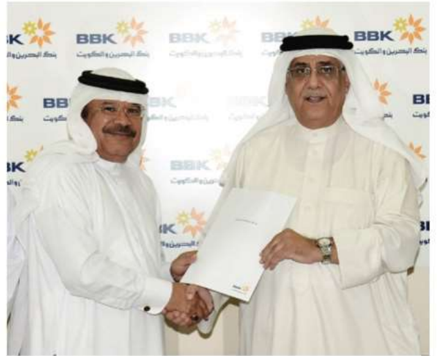
Batelco Care Centre for Family Violence Cases