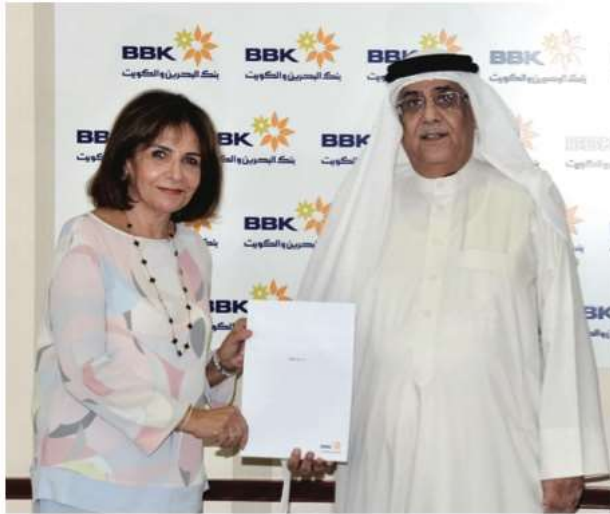
Child Care Home