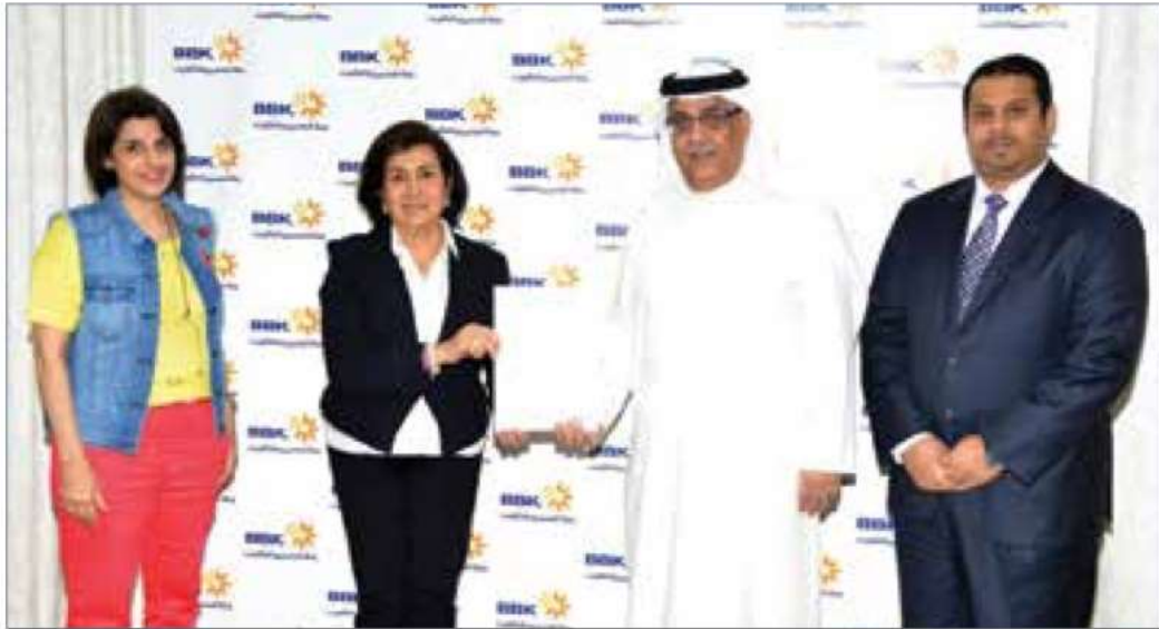
Bahraini Association for intellectual Disability & Autism