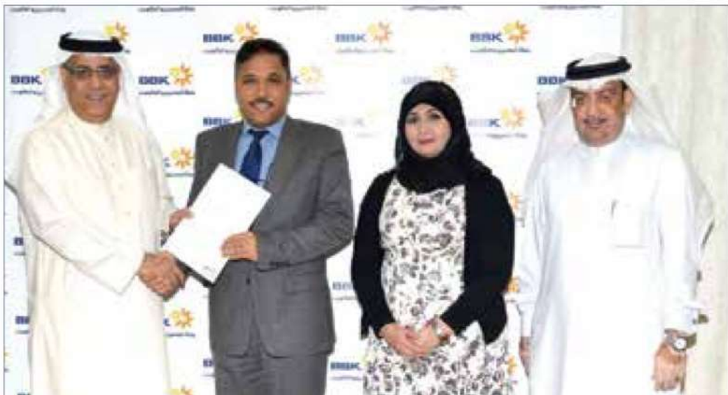
Al Manar for Parents Care