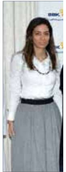
Ayadi Relief C